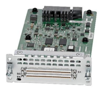
Figure 1. Asynchronous interface modules for Cisco 4000 Series ISRs